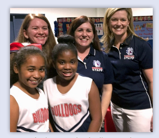
Burbank ES Visual and Folk Art Academy