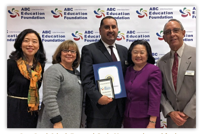
Long Beach Schools Financial Credit Union was honored for their contribution and time on the ABC Education Foundation Board.